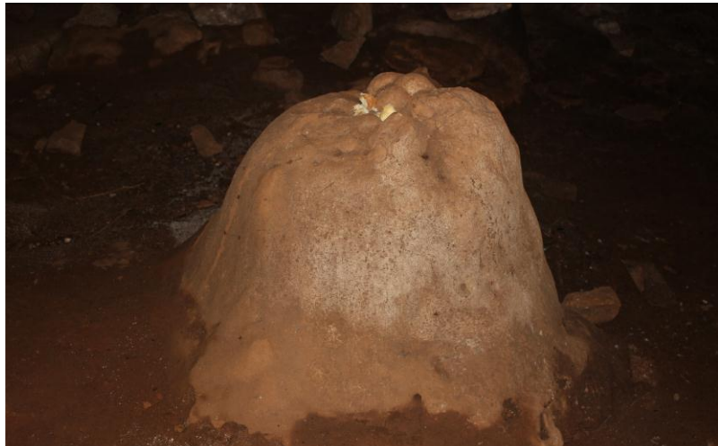
Photo 9: An offering of rice on a cave stalagmite made by local villagers to ancestral spirits. Tham Pakou, Savannakhet Province