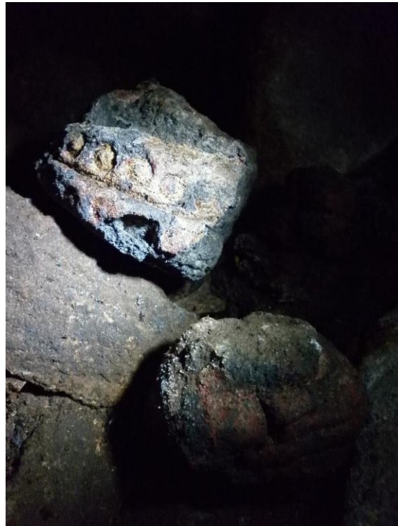
Photo 7: Decaying ancient wooden statues of the Buddha in a natural shrine at the rear of Tham Pakou , Savannakhet Province

The variety of uses for and values represented by caves and karst to some extent meet all of the categories required for national heritage protection, including natural heritage, historical heritage, and tangible and intangible cultural heritage. The Lao Law on National Heritage , introduced in 2005, provides the legislative framework for the protection of natural, cultural and historical heritage nationwide, recognizing significance on local, national or international levels (National Assembly 2005). Even though there is a provision for this within Lao heritage legislation, a low percentage of caves and karst are identified and protected nationwide, including in existing heritage management frameworks. Further, heritage management irregularly plans for or promotes multi-heritage uses and values of caves or karst. As has been identified by other research, when heritage values in caves or karst are not identified or managed appropriately, cave and karst environments and heritage values become at risk for