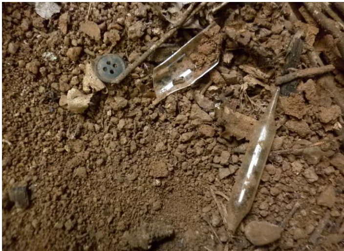
Photo 8: Material residue from cave use during the American War period. These include a broken glass syringe and a button from a military uniform. Tham Pakou , Savannakhet Province

damage or degradation (Day 2011; Day and Urich 2000; Kiernan 2009; 2011; 2013; Lyttleton and Allcock 2002). When assessing its role, it can also be argued that heritage legislation and the use of heritage practices are part of nationwide social economic development initiatives (Sourya et al. 2005). This generates three questions: Why is heritage managed and protected? For what is heritage managed and protected? Who decides what type heritage is managed and protected?