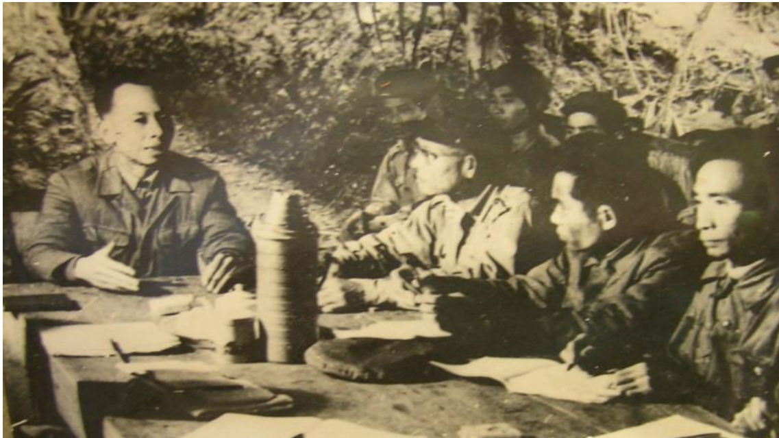
Photo 2: Khamtay Siphandon chairs an administration meeting in a cave shelter in Vieng Xay, Houaphan Province, during the American War period (LNTA 2014)

Caves continue to be identified as important places for various ethnic groups in the Lao PDR and some ethnic groups have been reported to incorporate caves and karst within cosmological belief structures and mythical narratives. In Savannakhet Province, some caves provide a residence or locality for ancestral and forest spirits of some Mon-Khmer language-speaking groups. Ancestral and other spirits often reside in caves and also live in forests, mountains and rice fields. These spirits are regarded by ethnic Brou people as ‘guardians’ of the places and function as ‘protectors’ of local clan groups. Spirits that reside in caves are called upon for ceremonies throughout the lunar and agrarian calendar year. Villagers propitiate spirits regularly to keep their families and their villages healthy and their crops prosperous (Chamberlain 2007; 2010). In Luang Namtha Province, the Vieng Phouka karst is the location of an annual ceremony in January in which a local shaman entices large fish from the cave to provide a feast for those present at the ritual (Kiernan 2009).