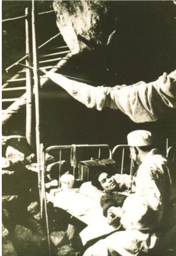
Photo 4: Caves in Vieng Xai also provided medical services for civilians and soldiers during the American War period (LNTA 2014)

with hydrological systems are recognised as supporting subsistence-based activities for rural populations, with caves and karst often incorporated into local land tenure systems (Kiernan 2013). In Khammouane Province, some caves provide refuge for fish in dry-season pools until the caves are flooded out again by monsoon rains. Young fish are looked after by local villagers in the dry season and brooding stocks are not