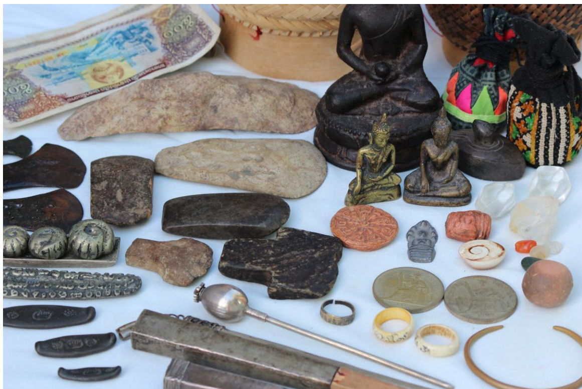
Photo 10: Prehistoric and historic artefacts are sold to tourists at street markets in Luang Phrabang. Some of these objects were looted from caves located nearby

fail due to a breakdown in communication between village, district, provincial and national agencies, which each have the responsibility, but not the training or capacity, to protect and promote heritage sites. Often the failure to fully understand, interpret and apply heritage and other legislation at one or more of these officiating levels occurs concurrently. In the Nam Ha National Protected Area, for example, a National Protected Area Management Unit (NPAMU) has been developed. Its objective is to monitor and manage legal and illegal development activity within the