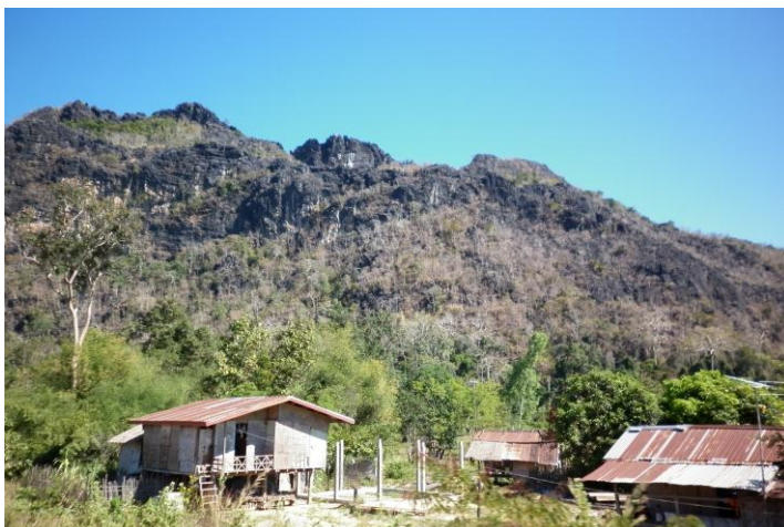
Photo 5: A village situated within a karst landscape in Khammouane Province

Cave and karst environments have played an important role in local economic and subsistence activities for many rural people in the Lao PDR, and were important places in prehistoric and hunter-gatherer lifeways (Higham 2012). Karst water catchments are recognized for providing human populations with suitable environments for growing wet rice and for swidden cultivation, and in general, karst provides wild food resources and supports intermittent seasonal occupation for hunting and gathering purposes (Kiernan 2011) (see Photo 5).