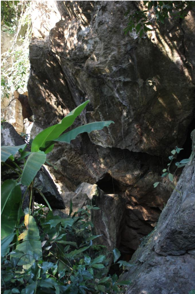
Photo 6: Entrance to Tham Pakou . Savannakhet Province

Many caves and much of the karst in the Lao PDR can be considered 'living places' that contain multiple, cross-cutting and often competing past and present values, being actively incorporated within an ideological and geographical landscape (Pannell and O'Connor 2005). This is reflected through the variety of uses and values caves have had in the past, and the uses and values they continue to have as natural places that support local and national cultural traditions (see Photos 6, 7, 8 and 9) (Kiernan 2009; Latinis and Stark 2005; Sidisunthorn et al. 2006). Increasingly, modernity is placing pressure on caves to be self-supporting as ecological places in their own right, while also relying on their capacity to support existing traditional uses and values amid recent social changes and economic development activities. The uses and values found in caves and karst in the Lao PDR have become multifarious and often compete with each other, with new uses