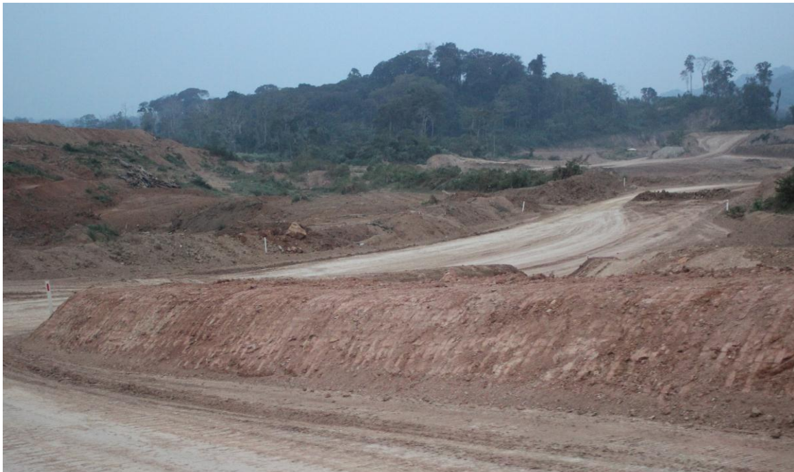
Photo 11: Mining haul roads encroaching on Tham Bing (top and center of picture) in Savannahket Province. A forested buffer-zone has been implemented to safeguard the natural and cultural values of the cave from mining-based impacts

In light of the view that many caves are 'living places,' pro-poor and community-based tourism projects are currently an alternative that is arguably more sustainable for communities and the environment than is mining, logging and dam construction. It is possible to promote tourism while achieving environmental protection and sustainable economic benefits in remote communities. Nonetheless,