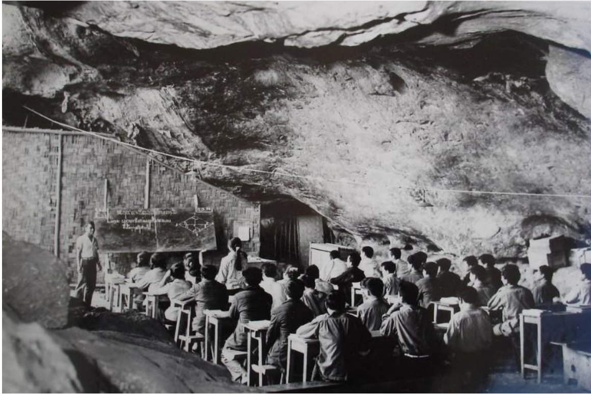
Photo 3: Caves in the Vieng Xai area were modified to accommodate for schools and revolutionary seminars during the American War period (LNTA 2014)