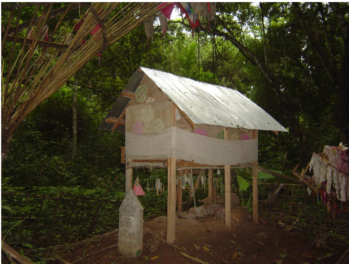
Figure 1: A Tai Dam spirit house erected in 2004 for a female villager who died at the age of 65 (according to the tomb stone).