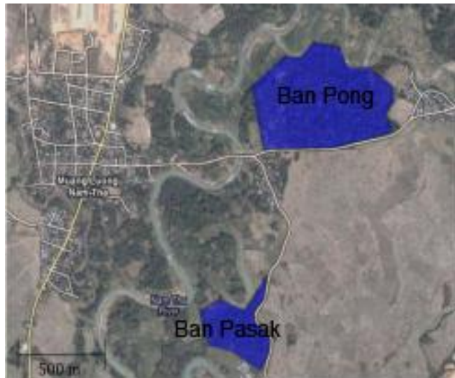
Figure 2: Map of the two study forests, Ban Pong and Ban Pasak. Areal image used from Google Maps.

Three villages, each with a corresponding funeral forest, reside near the Namtha River. The oldest of these villages, Ban Pong, is to the north. Younger villages are dispersed along the river due to the migration of families that left Ban Pong in order to find additional resources and space. Ethnobotanical data was collected during the summer of 2005 to determine traditional environmental knowledge, TEK, and the presence of active forest management. Ecological data – including GPS points, basal area and diameter at breast height (DBH) – were collected in both the Ban Pasak forest and the Ban Pong forest during the subsequent summer. These are the two forests that will form the capstones of the Green Discovery proposed corridor.